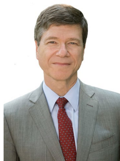
Jeffrey D. Sachs Director Sustainable Development Solutions Network