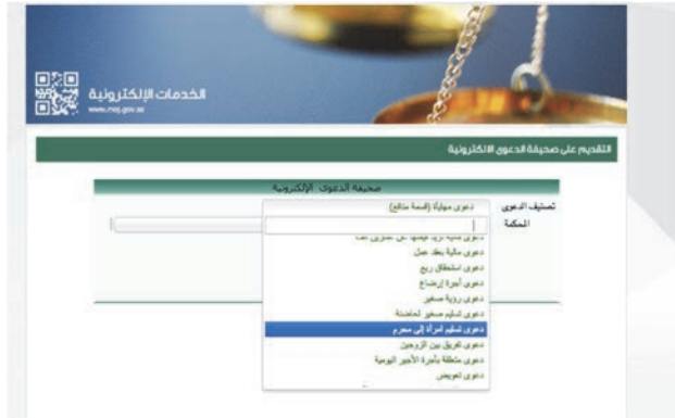
Electronic Complaints System, Saudi Arabia Ministry of Justice, “Claim for Returning a Woman to Her Mahram ,” accessed January 14 2016.