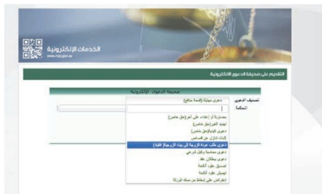
Electronic Complaints System, Saudi Arabia Ministry of Justice, “Claim for Returning Wife to Marital Home,” accessed January 14 2016.