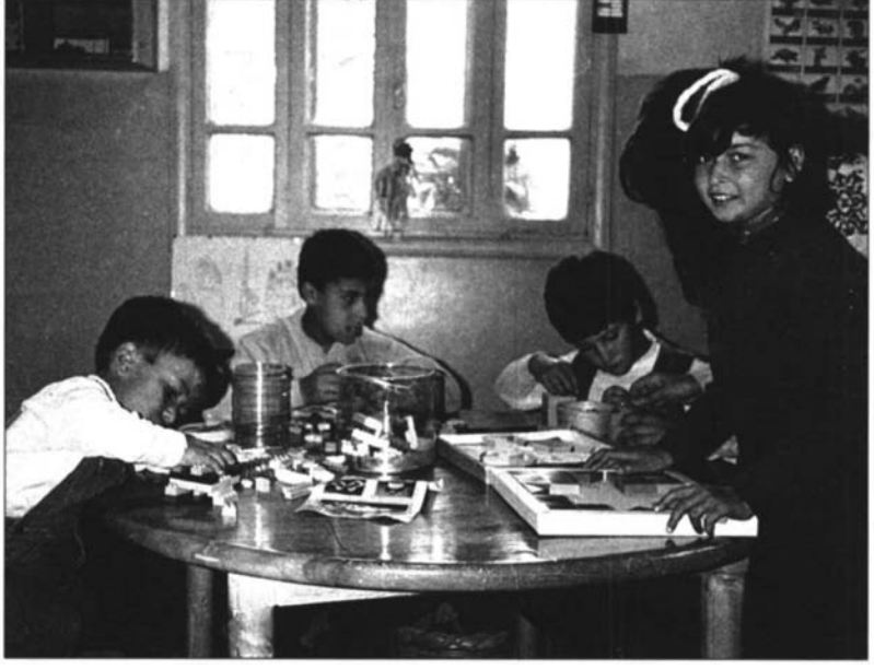
The Happy Home Centre not only provides educational facilities for children with learning disabilities, but also supports mothers of disabled children.