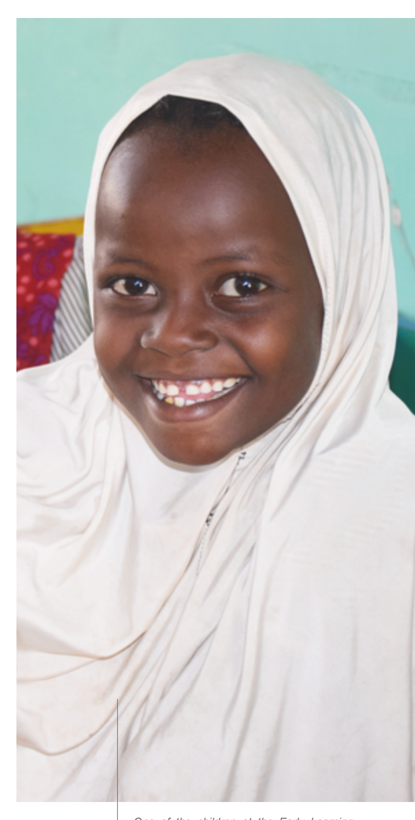
One of the children at the Early Learning centres (ELC) for children with specific needs run by UNHCR's partner Intersos. This centre is in Kharaz refugee camp, and is one two such centres. The other centre is in the Basateen area (in Aden, southern Yemen) and serves refugees children with specific needs living in urban areas.

UNHCR funded initiatives which support persons with disabilities with 'specific needs' also support caregivers. Education, training, peer group support and counselling has been provided for caregivers in Libya, Egypt, Lebanon, Jordan, Iraq and Yemen. The key informants highlighted the positive impact of such initiatives with the view that support for caregivers will ultimately ensure sustainable support for children with disabilities, particularly in resource constrained contexts.