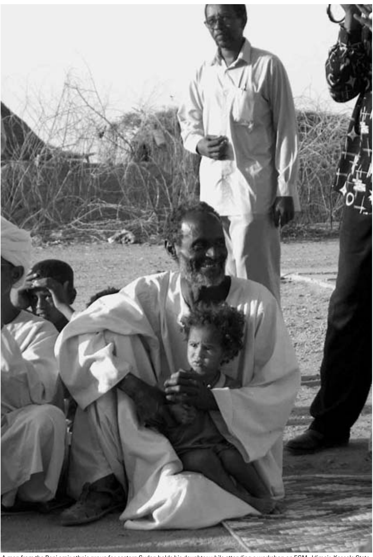
A man from the Beni amir ethnic group for eastern Sudan holds his daughter while attending a workshop on FGM, Idimair, Kassala State.