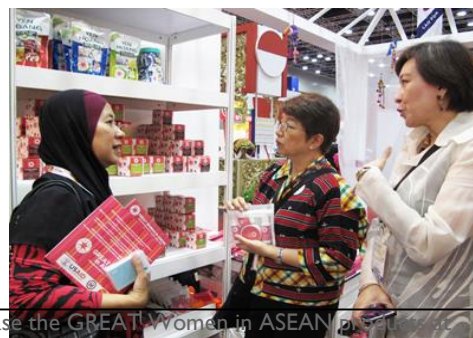
Women entrepreneurs showcase the GREAT Women in ASEAN products at the ASEAN SME Showcase and Conference 2015 in Kuala Lumpur.

As trade-facilitation projects respond to USAID’s commitment to integrating gender considerations into all of its work, these groups can be analyzed in terms of their programmatic implications. In particular, each group implies the need for increased consultation with stakeholders who can articulate the priorities and concerns of female traders and border officials. Although the Comprehensive Approach does not speak to the dimensions of planning that may relate to women’s participation in trade