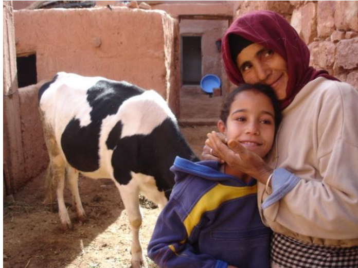
Rural women benefiting from microfinance in Morocco.