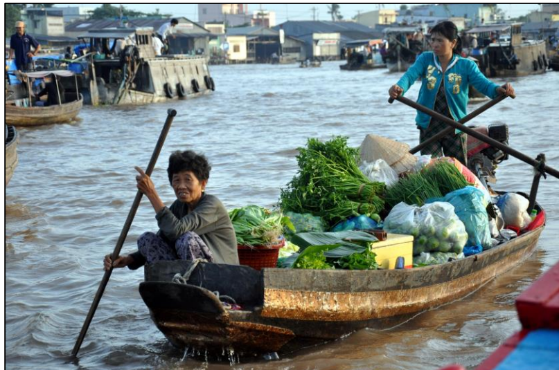
Floating market in Can Tho, Vietnam.

Through improved collection of data, particularly in recent years, knowledge about the gender dynamics of donor interventions and other economic empowerment activities is growing. A great deal of information continues to be lost, however, due to the lack of sex-disaggregated information on the impact of global trade and trade-oriented reforms. Although information about education and health outcomes for men and women is generally well