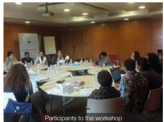
Participants to the workshop

This meeting also allowed to prioritize the areas of intervention of the CSO network in order to organize its future advocacy activities. On the basis of this prioritization effort, an advocacy plan for the recognition and the promotion of SRRR in Tunisia will be developed.