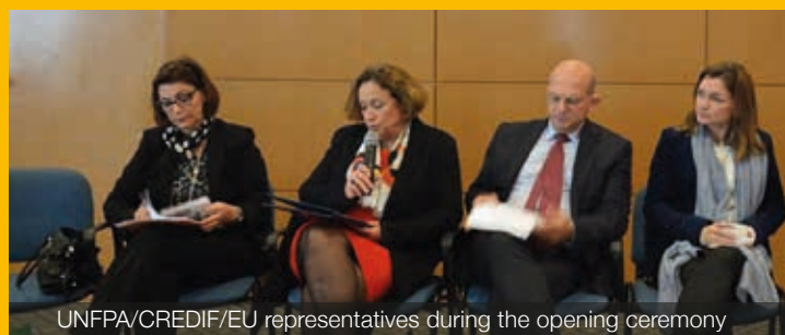
UNFPA/CREDIF/EU representatives during the opening ceremony

Further advocacy activities are planned in 2017 to promote the Organic Law on Violence Against Women among Members of the Parliament.