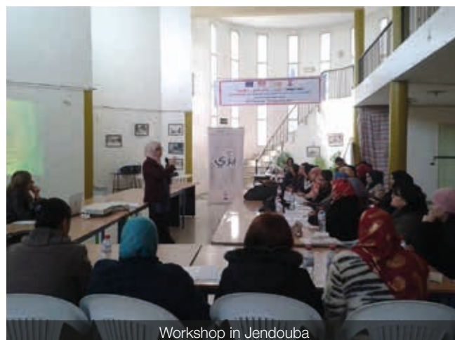
Workshop in Jendouba

The second objective of these workshops is to inform civil society and governmental institutions operating in this field about the essential services package for women and girls subject to violence. The intersectoral approach of the services is fundamental. During these workshops, international standards were presented by sector (health / police / justice / social affairs) and the coordination between these sectors appears as a major issue. It's important to foster communication between the various community workers and their government counterparts in order to offer a complementary, effective and quality response to the victims.