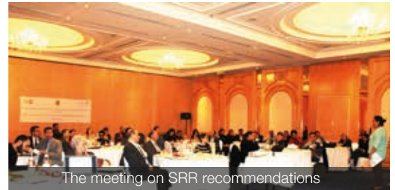
The meeting on SRR recommendations