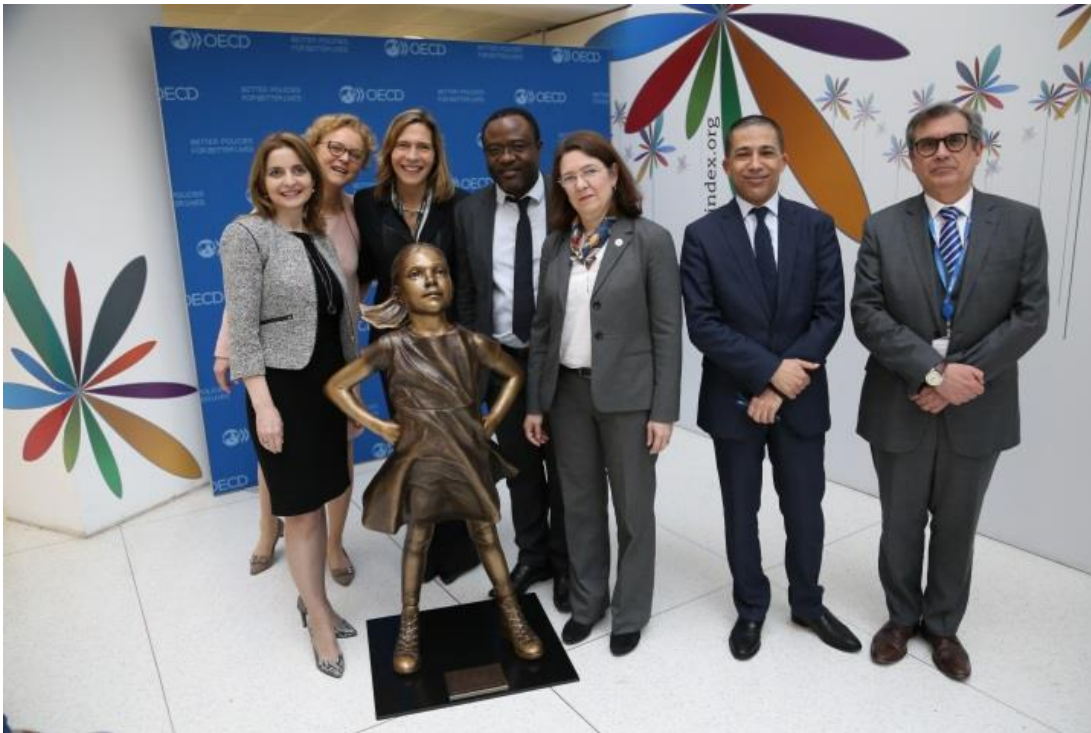
Session speakers and the organisers with the "Fearless Girl" statue loaned to the OECD for March on Gender month.

The conclusions of this meeting will nourish on-going work by the OECD, notably to continue collecting good practices on legal reform for women's economic empowerment as this responds to country requests and real needs.