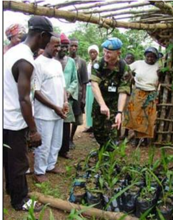
Peacekeepers should always show respect and impartiality to the local population.

In the following portion of this section, each principle is explained and accompanied by relevant "Dos and Don'ts" to guide peacekeepers. Some of these guidelines will often apply to more than one principle.